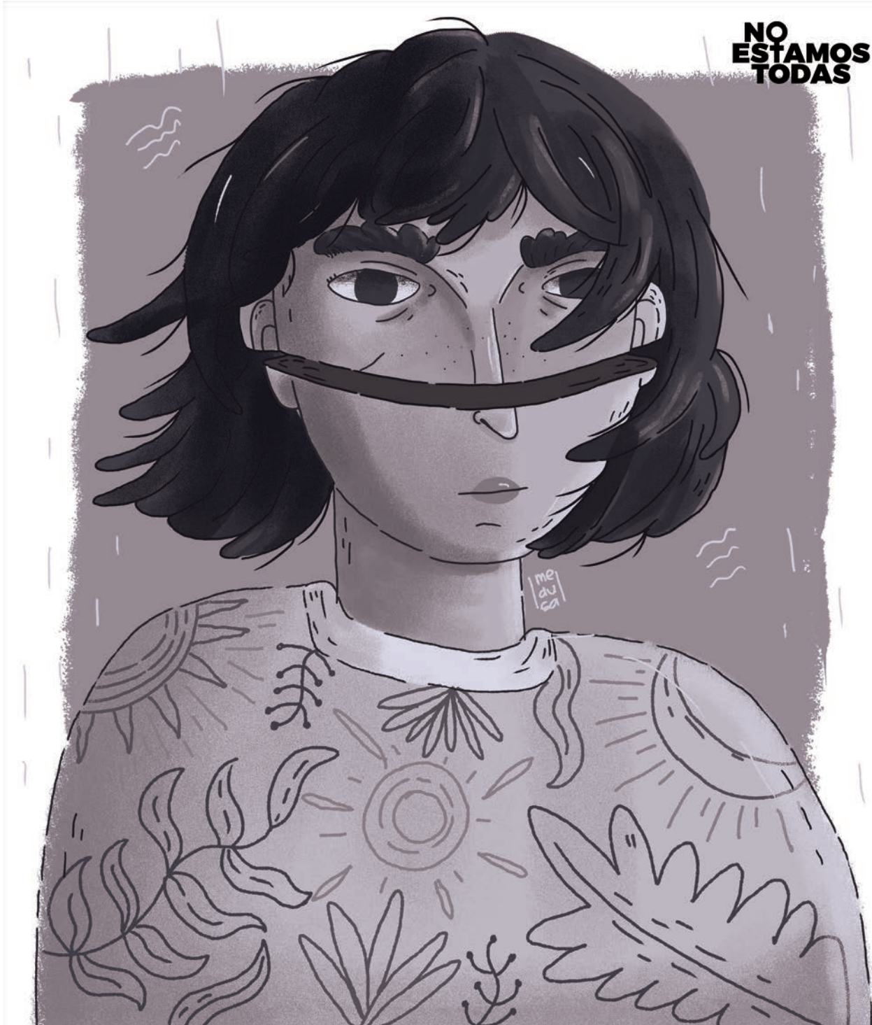
© “Beverli, 24 years old” illustrated by Medusa

No Estamos Todas is an illustration project to visualize victims of feminicides and transfemicides in Mexico. A collection of their meaningful work complements this tenth volume of FEMICIDE. Further information can be found on www.noestamos todas.com .