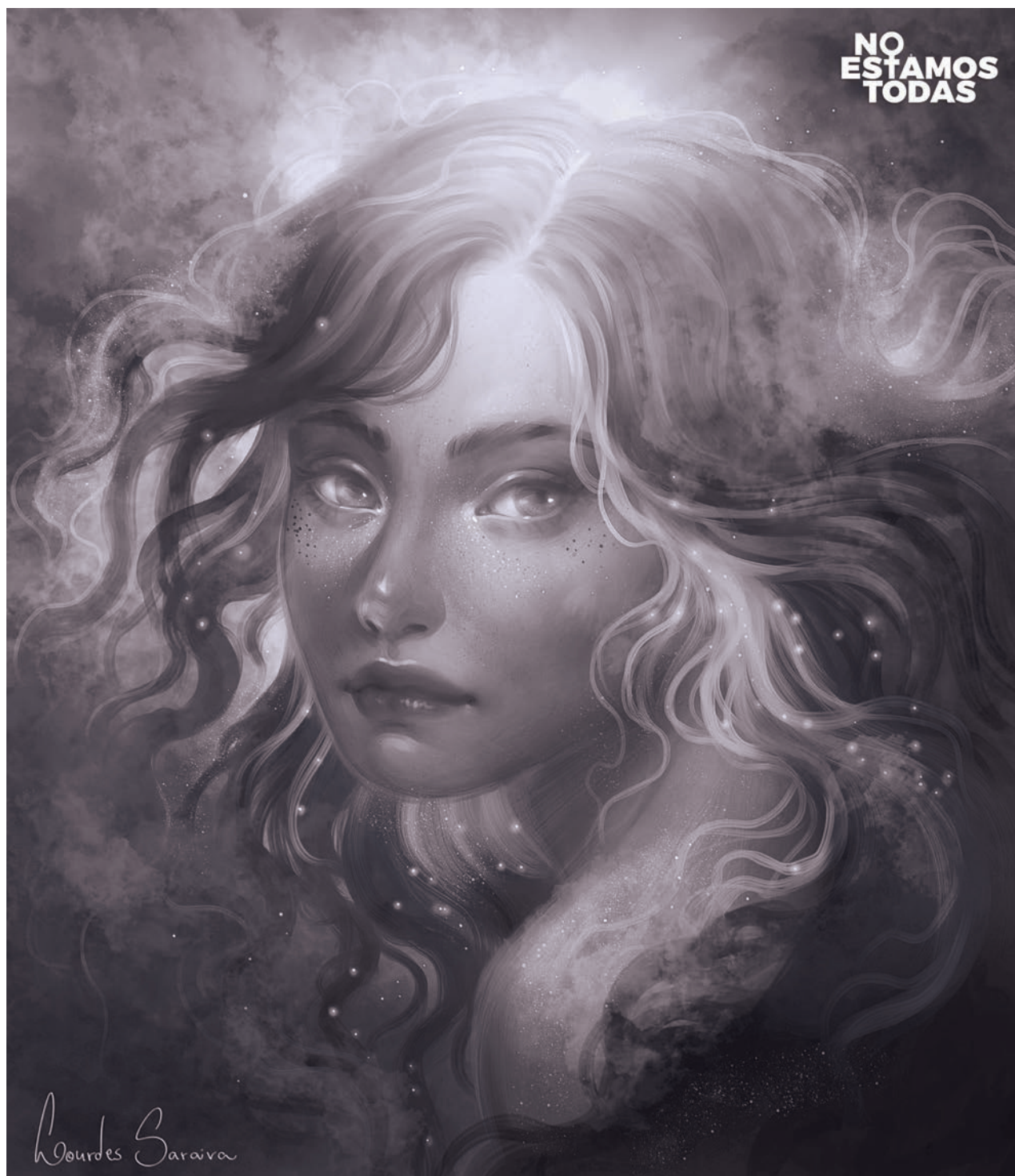
© "Maricela, 31 years old" illustrated by Lourdes Saraiva

No Estamos Todas is an illustration project to visualize victims of feminicides and transfemicides in Mexico. A collection of their meaningful work complements this tenth volume of FEMICIDE. Further information can be found on www.noestamostodas.com .