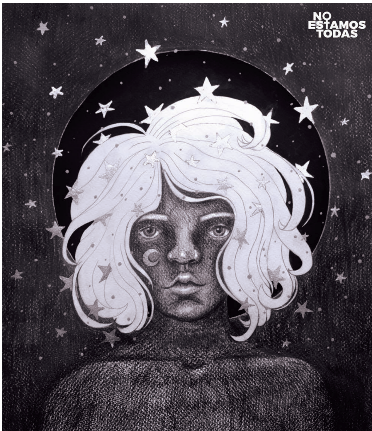
© "Paula, approximately 30 years old" illustrated by Valeria Araya Tamayo

No Estamos Todas is an illustration project to visualize victims of feminicides and transfemicides in Mexico. A collection of their meaningful work complements this tenth volume of FEMICIDE. Further information can be found on www.noestamos todas.com .